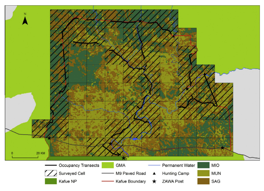
Fig. 2. Occupancy survey design.